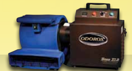
ODOROX® Boss XL3™ Unit with External Blower* *Blower sold separately