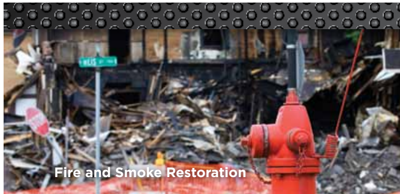
Fire and Smoke Restoration