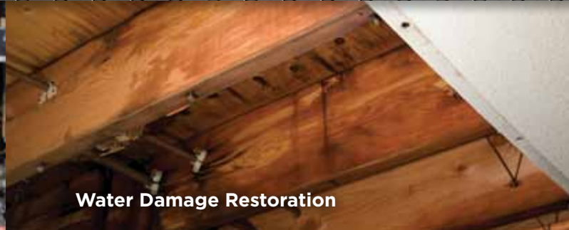
Water Damage Restoration